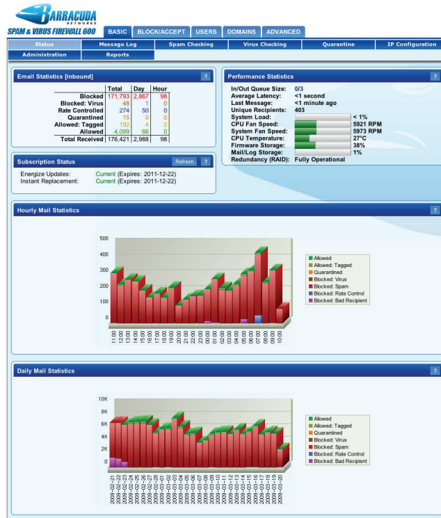
The Barracuda Spam & Virus Firewall filters all email messages and displays the number of emails received with statistics on how they were processed.

With no software to install or network modifications required, the Barracuda Spam & Virus Firewall is easy to set up. Barracuda Energize Updates are delivered automatically by Barracuda Central, an advanced technology center where engineers work continuously to provide the most effective methods to combat the ever changing spam and virus variants. Barracuda Energize Updates, including the latest spam definitions, virus definitions and security updates, are distributed hourly for continuous protection against the latest threats.